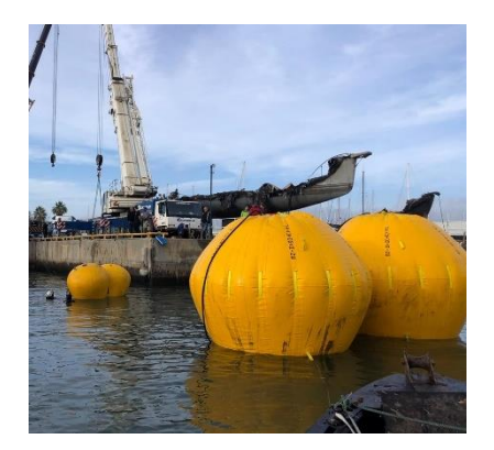
Parachute Enclosed Liftbags