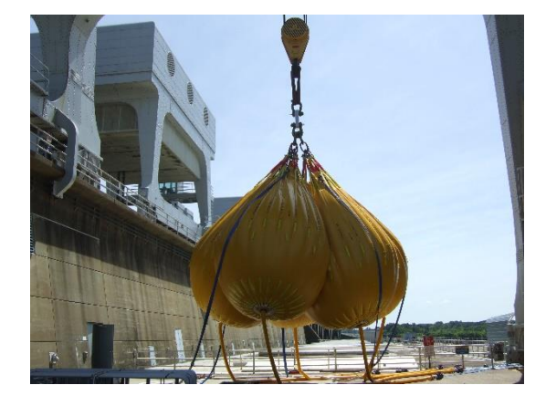
Proof Load & Lifeboat Test Bags