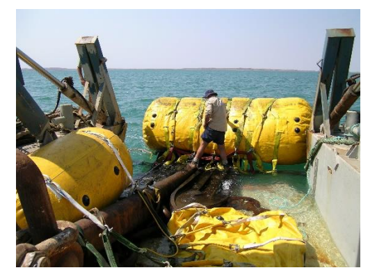
Cylindrical Enclosed Liftbags