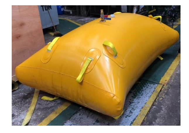
Flexi Tainer Containment