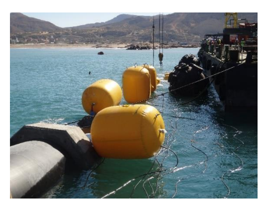
Single Point & Shore Pull Liftbags